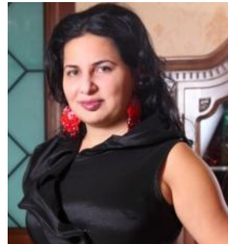
Dr. Ruja Ignatova