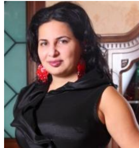
Dr. Ruja Ignatova